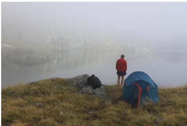
Commended Hut/Camp Life.