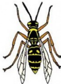
Asian Paper Wasp Polistes chinensis

The world's largest recorded wasp nest was discovered at Waimauku (near Auckland). It was 3.75 metres tall and 1.7 metres wide.