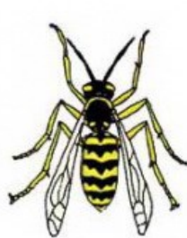
Common Wasp Vespa vulgaris