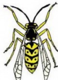
German Wasp Vespa germanica