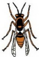
Australian Paper Wasp Polistes humulus