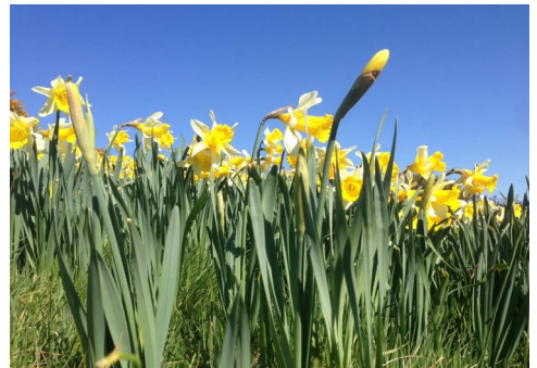
Daffodils at Wetherstons farm