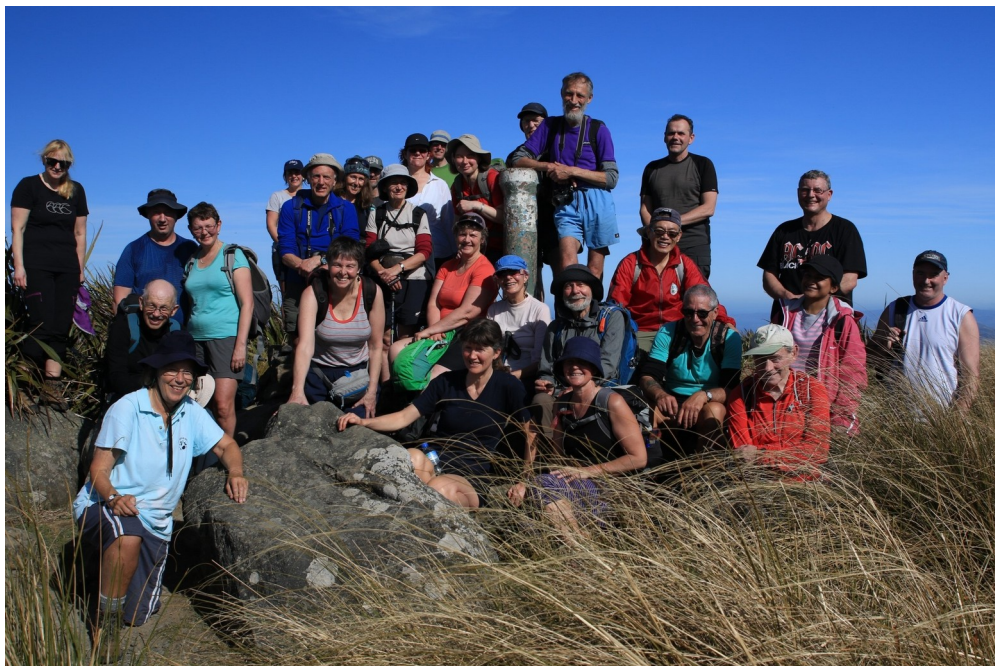
Re-enactment of our very first club trip: The party at Flagstaff See trip report on page 7.

Newsletter of the Otago Tramping and Mountaineering Club Inc # 809 November 2019