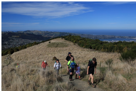
Pineapple Point Lookout