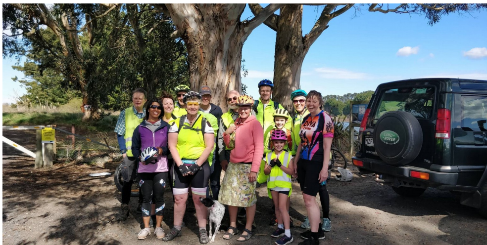
Cycling team at Waldronville