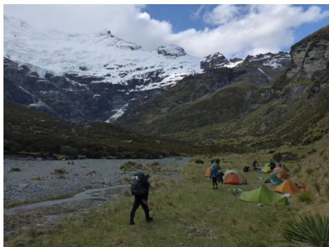
Earnslaw Burn

Earnslaw Burn is a spectacular valley below Mt Earnslaw with great views of the glacier. We'll camp somewhere near the head of Lake Wakatipu on the Friday night. On Saturday it's about a 4 ½ hour tramp through beech forest to the Bushline at approx 900m, then the valley is fairly flat heading towards the South Face of Mt Earnslaw. Depending on the size of the group we may camp at different locations in the valley, or some may choose to stay at NZ's best? rock bivy at the bushline. We can go exploring to the head of the valley, surrounded by waterfalls coming off the glacier (Swim anyone?). On Sunday fitter members can head up to