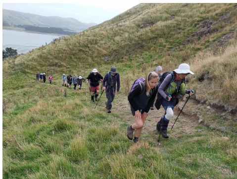
Climbing Mt Charles

We travelled out to Portobello in 5 cars meeting at the service station. We then travelled along Allans Beach road and onto Cape Saunders road crossing from Hoopers Inlet to Papanui Inlet. There is an old homestead site at the start of the route so we had a look around there before heading up the mountain.