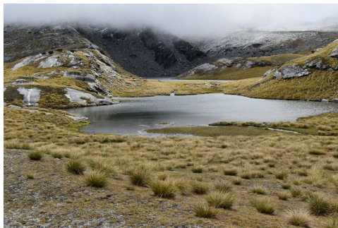
Our campsite

We headed out via the pass above Lake Alta after lunch. By now the sun was quite warm and we had a break by the lake. Not warm