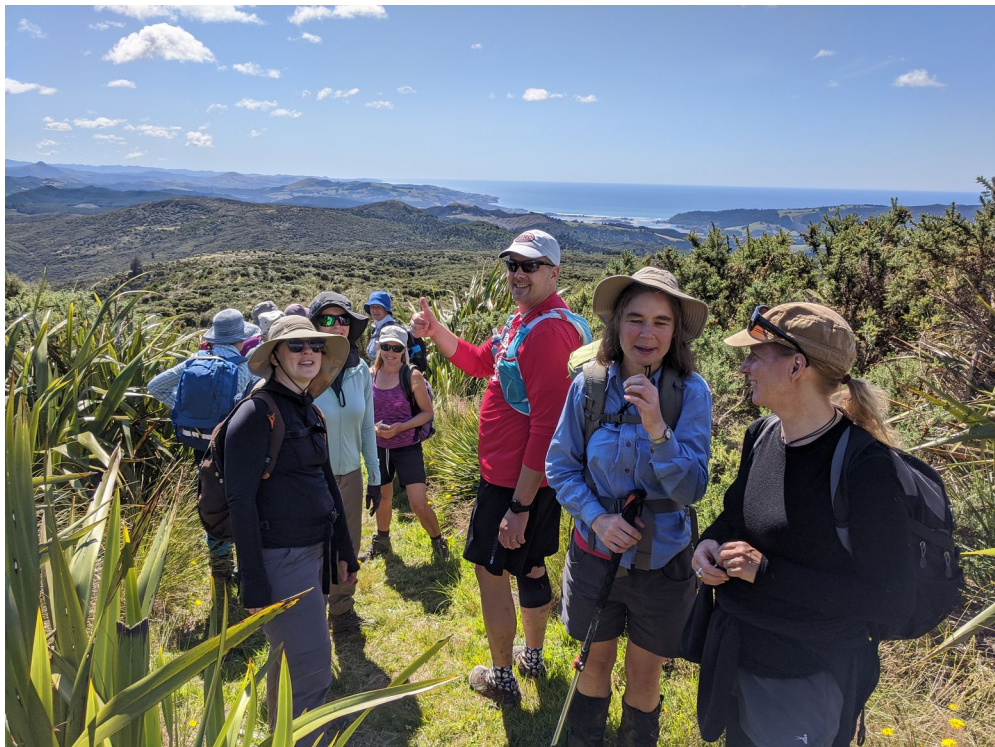
From Swampy Summit Circuit daywalk – see trip report on page 4