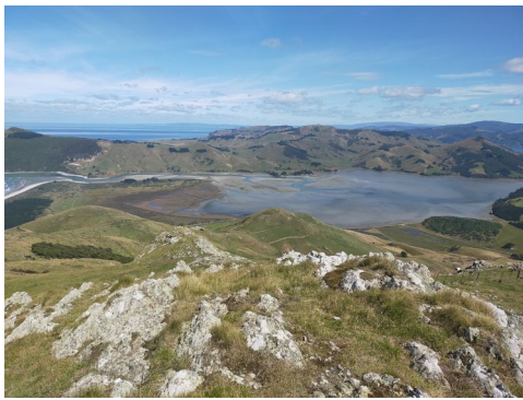
Hoopers Inlet and Otago Peninsula from Mt Charles

We arrived back at the cars around lunch-time so many of the group did an extra side trip to Allans Beach for lunch. We had a