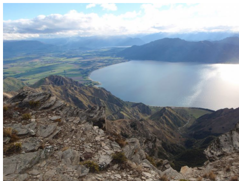
Lake Hawea from Breast Hill summit

The plan is to drive to Glenorchy, then up the Dart Valley and camp Friday night at the Sylvan Campsite. In the morning we will go back down the road a short distance to Scott Creek. It's quite steep up hill for the morning to Scott Basin. Then we keep following the main stream upward, passing by point 1552, great views of Earnslaw and the Dart Valley from here. Some more climbing then descend down into Death Valley. We can camp at the big tarn at the head of the valley. The next day head down valley to Kay Creek Hut and perhaps stay there or in Scott Basin. We'll retrace our route and head out via Scott Creek.