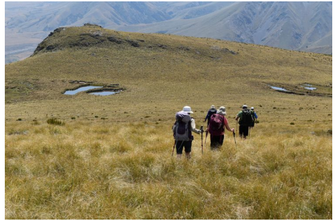
Heading down to the bus-stop