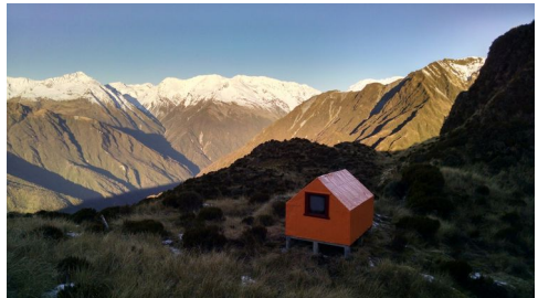
Pinnacle Biv

Having been high on Sarah's list of places to explore for many years, this trip promises to cover some interesting and challenging terrain in an area a bit further than usually accessible for weekend club trips. Route descriptions indicate high potential for some good old fashion bush bashing and navigating some sections of untracked terrain, and some longer days (expect 8hrs +) so this is definitely a Fit rated trip. However, the rewards include striking valley travel, an alpine saddle crossing, river crossing, small canyons, boulder hopping, the allure of a natural hot spring (if it does in fact exist) and