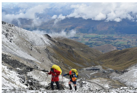
Heading over the pass above the skifield

We continued on and set up the tents and then 4 of us decided to go across the basin